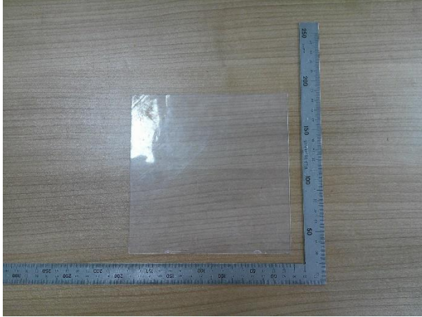
样品 3 / Sample 3