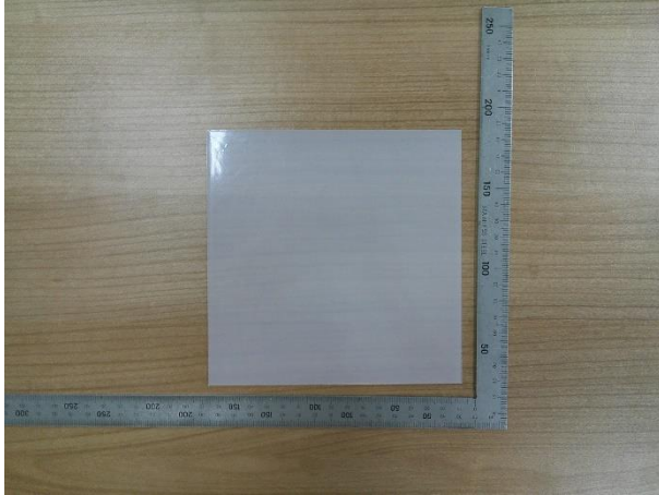
样品 12 / Sample 12