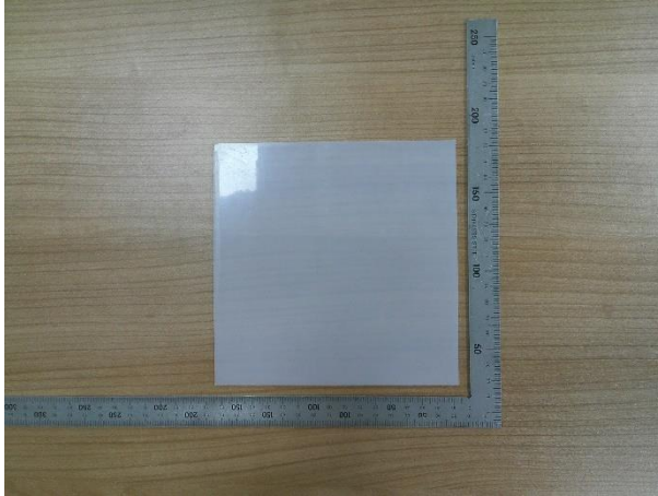
样品 9 / Sample 9