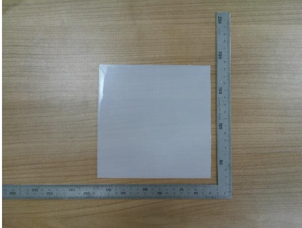
样品 8 / Sample 8