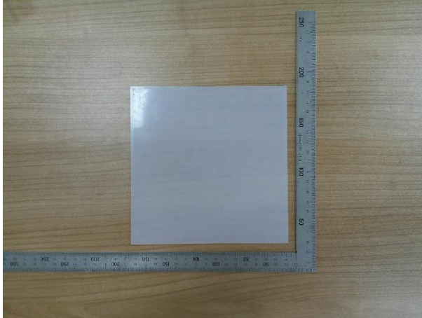
样品 7 / Sample 7