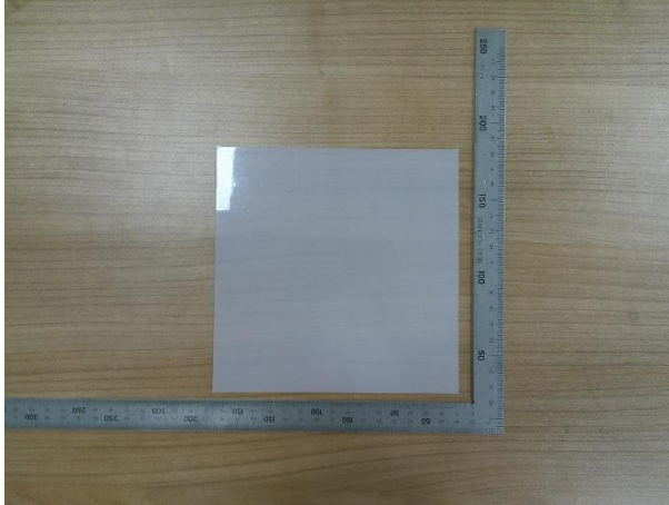
样品 6 / Sample 6