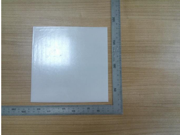
样品 17 / Sample 17