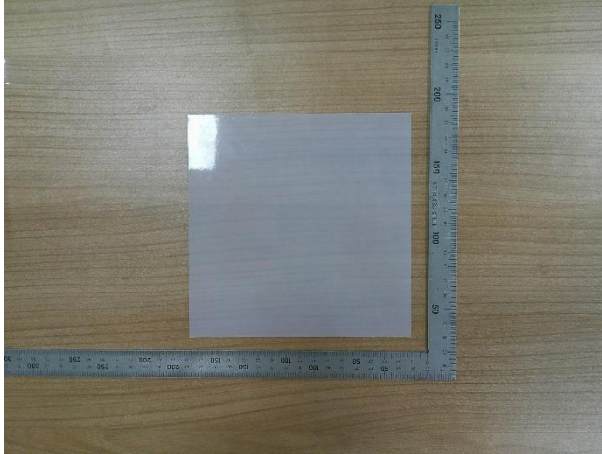
样品 13 / Sample 13